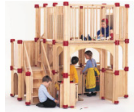
new loft in each classroom

ST. MARK COMMUNITY PRESCHOOL a special place for our children